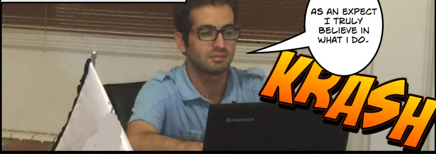
MEANWHILE IN IRAN...

AS AN EXPECT I TRULY BELIEVE IN WHAT I DO.